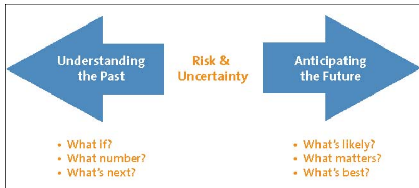
Figure 1: Understanding the past can help model the future.

Making the right decisions requires you to anticipate and plan for possible changes in the future. A common approach to anticipate these changes is to first assess the company's current position by analyzing historical information to understand the company's past.